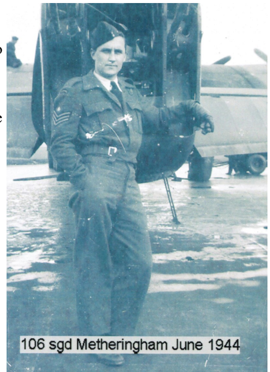
106 sgd Metherringham June 1944