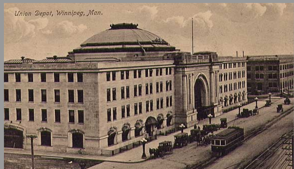
Union Depot, Winnipeg, Man.