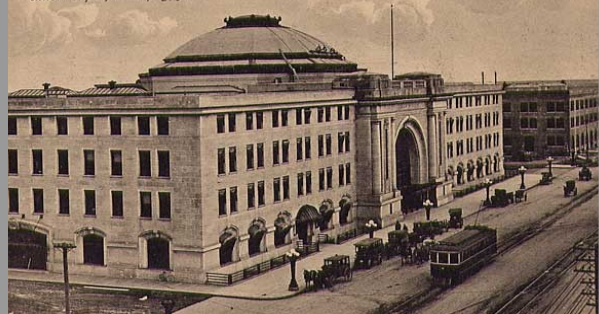
Union Depot, Winnipeg, Man.