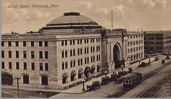
Union Depot, Winnipeg, Man.