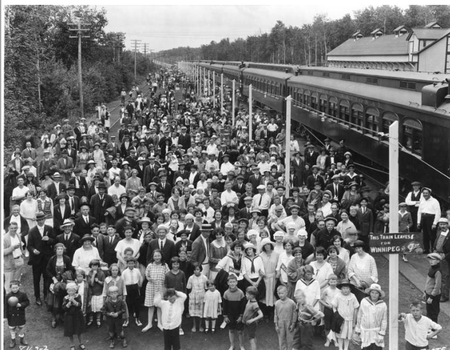
For decades thousands of people used trains to reach Grand Beach from Winnipeg such as this one in 1923

An interesting website that members may want to visit is: http://trainweb.org/oldtimetrains . You will find many interesting stories, pictures and more from days gone by.