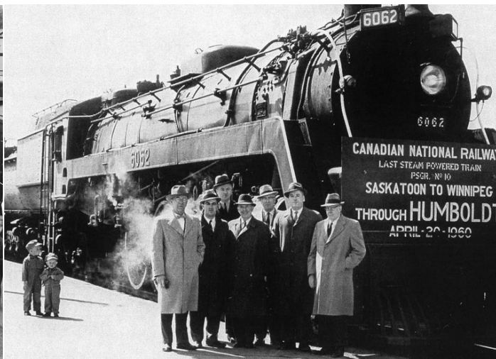
CN6062 is hauling the last scheduled run of steam on passenger service, April 1960. Those two little guys are nearing pension now!

Visit our website often at www.cnpensioners.ca to view our newsletters or our Facebook page www.facebook.com/cnpensionersmanitoba for updates and announcements .