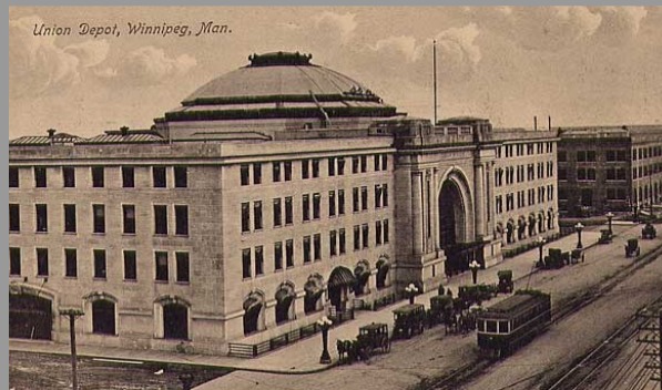
Union Depot, Winnipeg, Man.