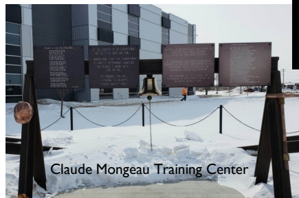
Claude Mongeau Training Center

Our thoughts are also with their families, friends and colleagues.